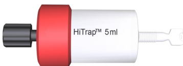
Fig 2. HiTrap, 5 ml column.

Note: HiTrap columns cannot be opened or refilled.