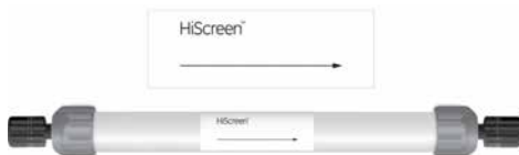
Fig 1. HiScreen column

HiScreen columns are made of biocompatible polypropylene that does not interact with biomolecules. The columns are delivered with stoppers at the inlet and outlet. The arrow on the column label indicates the column orientation and the recommended flow direction see Figure below.