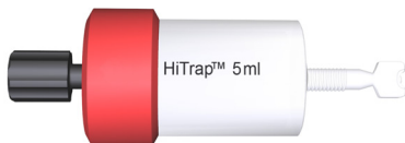
Fig 2. HiTrap, 5 ml column.

Note: HiTrap columns cannot be opened or refilled.