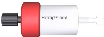
Fig 2. HiTrap, 5 ml column.

Note: HiTrap columns cannot be opened or refilled.