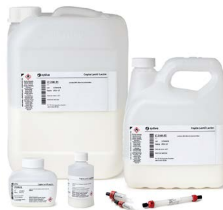
Fig 1. Capto™ Lentil Lectin resin is produced in an animal component-free environment and is covered by our security of supply program.

Capto™ Lentil Lectin resin is designed by coupling lentil lectin to an N-hydroxysuccinimide (NHS)-activated high-flow agarose base matrix (Fig 2). Lentil lectin is a metalloprotein isolated from Lens culinaris (lentil) seeds and binds to molecules containing \alpha -D-mannose, \alpha -D-glucose, or sterically related residues. To maintain the binding characteristics of Capto™ Lentil Lectin, the presence of both Mn^{2+} and Ca^{2+} is essential. These ions are present in large excess in the recommended storage solution for the resin. The lectin-metal ion complex remains active and is stable at neutral pH, even in the absence of free metal ions. However, to preserve the binding activity of the resin at pH < 5, excess Mn^{2+} and Ca^{2+} (1 mM) should be present in the buffer solutions. Main characteristics of Capto™ Lentil Lectin are summarized in Table 1.